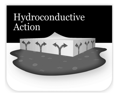
Figure 3. Hydroconductive action results from moving from wetter (wound) to drier (Drawtex) even against gravity. Governed by Darcy's Law, the fluid can move both vertically and horizontally.