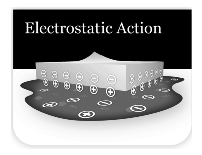
Figure 4. Electrostatic action results in attraction of negatively charged bacteria and cytokines (MMPs) to the positive charge at the surface of Drawtex. The positive charge at the Drawtex surface results from an electric double layer as positive ions from the edema/exudate coat the slightly negatively charged Drawtex.

It appears that the combination of capillary, hydroconductive, and electrostatic actions are working in concert to provide the unique mechanistic functions attributed to Drawtex. These proposed mechanisms may not totally explain the actions of Drawtex due to the difficulty of applying physicochemical theory to biological systems [12]. The sum of these actions accounts for the effectiveness of the dressing in removing edema from the